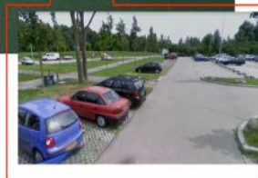
Parking cars etc.