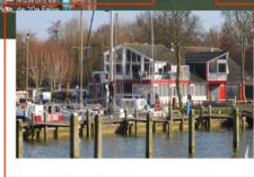
Clubhouse WSV Hoorn